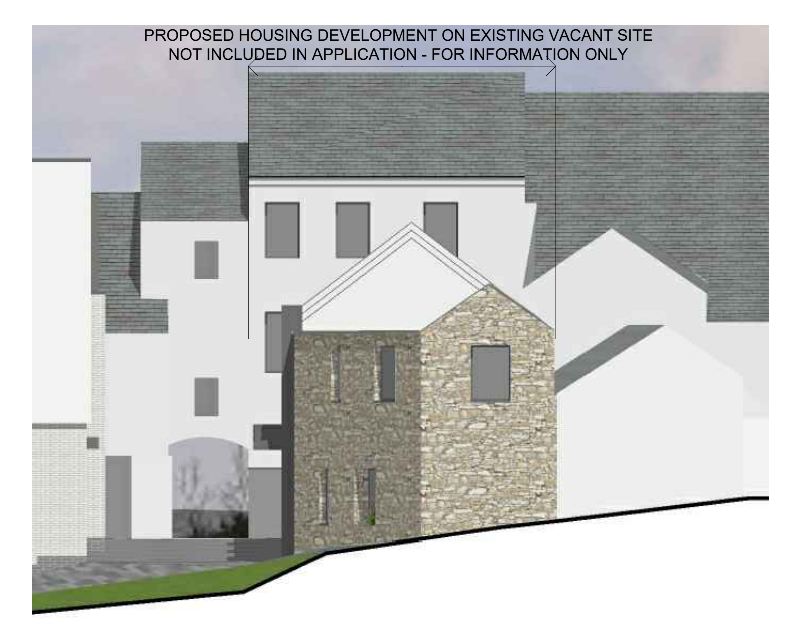
PROPOSED SOUTH ELEVATION SCALE 1:100